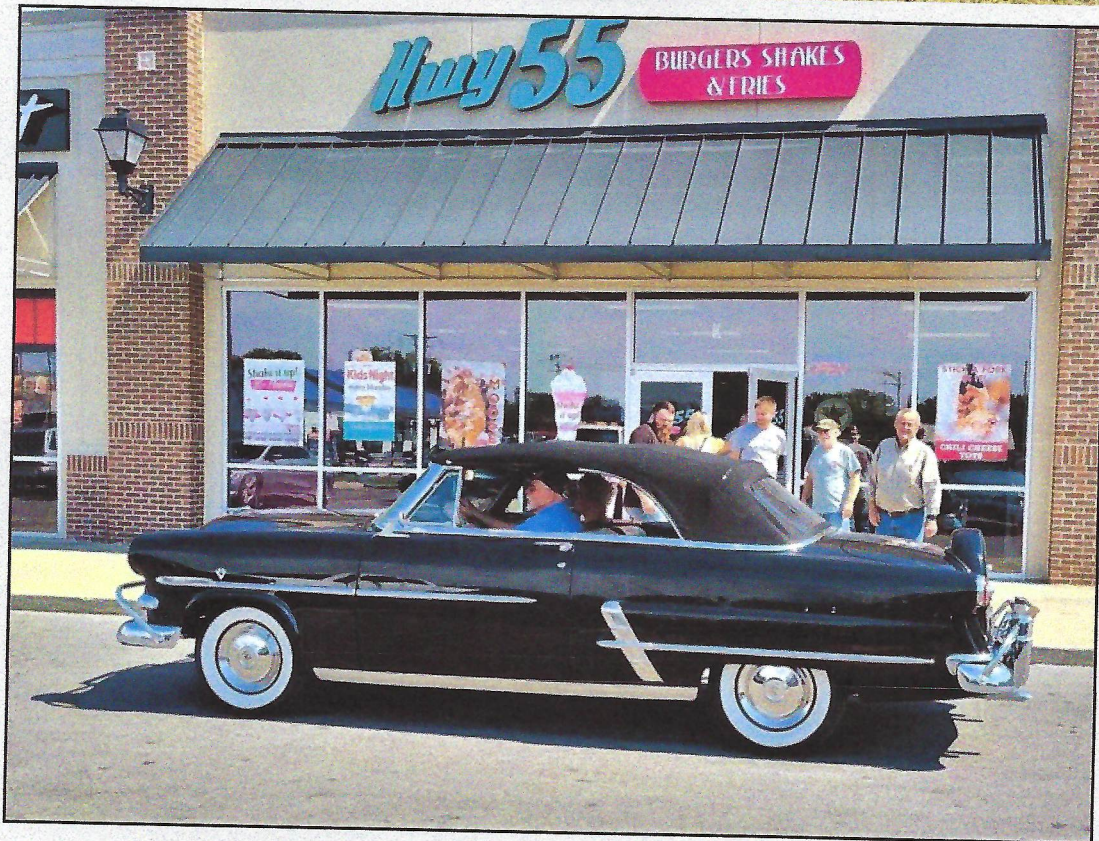
The Philbrooks' 1953 Ford Crestline Sunliner Convertible at the September 2023 visit to the Jim Bratcher collection In Shelbyville, TN, in September, 2023